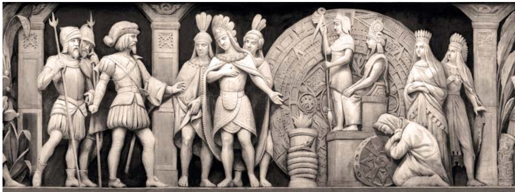
Montezuma is shown gesturing to the sacred fire with a serpent wrapped around it. According to the Aztec calendar, the fire is predicted to burn out on Dec. 21, 2012.

It depicts Spanish explorer Hernando Cortez, the conqueror of Mexico, entering the Aztec temple in 1519. He's welcomed by Emperor Montezuma II, who thought Cortez was a god.