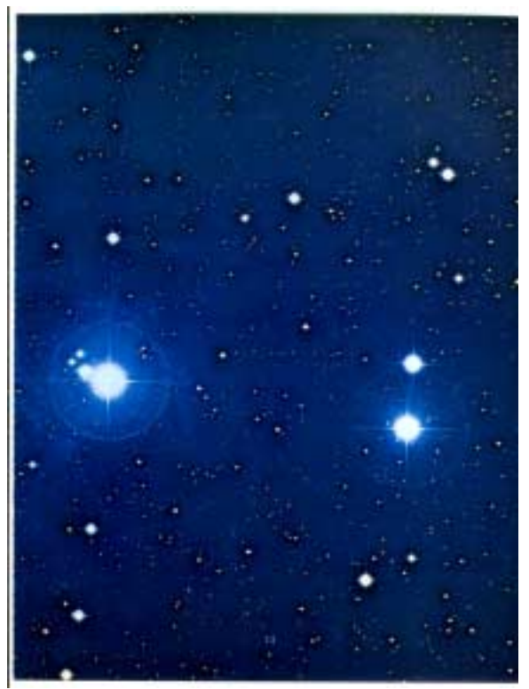
After working six days of Creation, God rested The seventh day, ordaining it to be a perpetual Sabbath of rest.

1. Did God refashion and create every physical thing of our present world in just SIX days? Review quickly Gen. 1:5, 8, 13, 19, 23, 31.