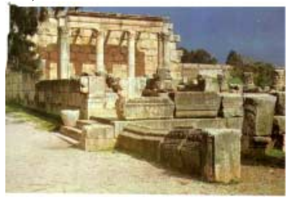
Ruins of ancient synagogue at Capernaum, a city which Jesus upbraided for their wickedness.

6. Was it Christ's "custom" to attend Church services on God's Sabbath? Luke 4:16,31.