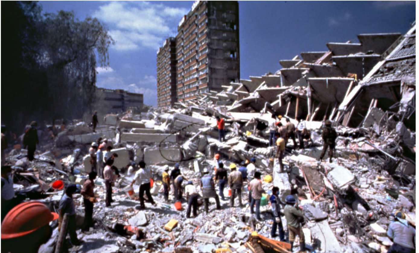
Earthquake in Mexico -- 1985